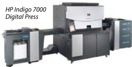
HP Indigo 7000 Digital Press

nine digital presses are expected to account for 35 percent of the company's 2008 revenues. Additional information about HP Indigo 7000 Digital Presses is available at www.hp.com .