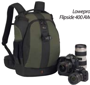
Lowepro Flipside 400 AW

Lowepro (Sebastopol, CA, www.lowepro.com ) has added six products to its stylish line of camera bags and backpacks. They include the Luxe, a premium-leather