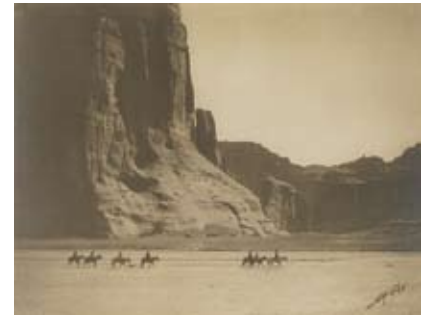
"Canyon de Chelly," by Edward S. Curtis, The J. Paul Getty Museum, Los Angeles

The J. Paul Getty Museum (Los Angeles, CA, www.getty.edu) presents "In Focus: The Landscape," which offers an overview of the history of landscape photography from the dawn of the medium to the 20th century. "The photographs in this exhibition were selected from hundreds of ex-